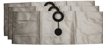
Conductive Recovery Bags - included