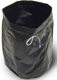
Conductive Polyliner Recovery Bag - Included