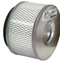
HEPA Filter - Included