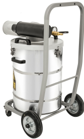
AVSD-40L (2+2W) Rear View