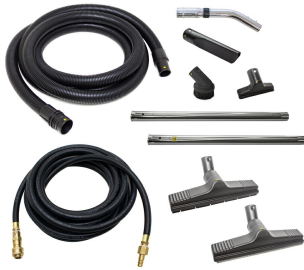
ATEX/AVSD Tools and Accessories W&D - Included