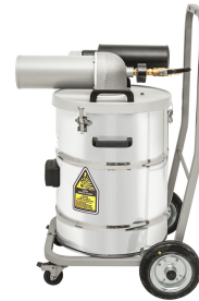
AVSD-40L (2+2W) Side View